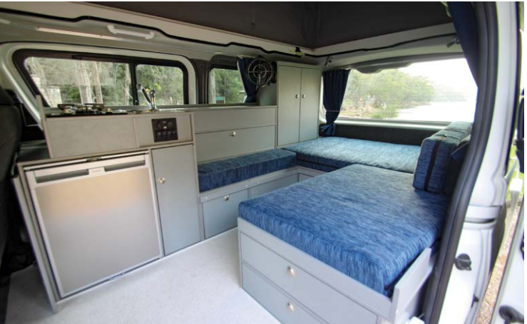
ALL NEW FRONTLINE CAMPERVANS HAVE SECOND STAGE COMPLIANCE PLATE APPROVAL. THIS IS A MANDATORY NATIONAL CODE FOR MODIFYING NEW VEHICLES AND IS APPLIED FOR YOUR SAFETY.

The previous Hiace model was in production for fifteen years so this model is well overdue. The new model arrived in the Frontline Factory mid 2019 and the team went to work on a new campervan design concept.