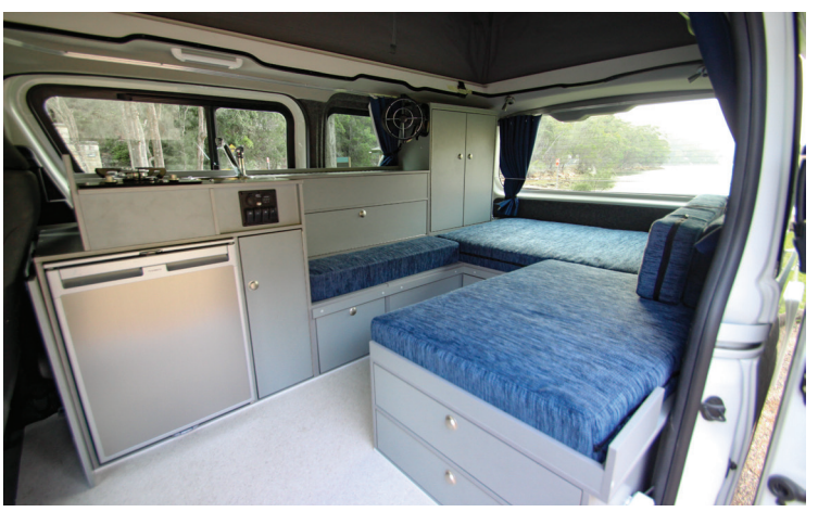
ALL NEW FRONTLINE CAMPERVANS HAVE SECOND STAGE COMPLIANCE PLATE APPROVAL. THIS IS A MANDATORY NATIONAL CODE FOR MODIFYING NEW VEHICLES AND IS APPLIED FOR YOUR SAFETY.